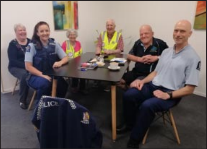
Community support representatives at Te Awaroa Cafe for coffee and a chat.

Helensville Police Station: 09 420 8967 South Kaipara Community Patrol: southkaiparacp@gmail.com Rodney Neighbourhood Support: rns.coordinator@gmail.com