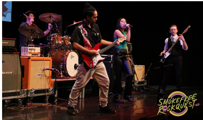
Kaipara College band Sonitus performing at the Rockquest regional heats.

All Kaipara College band members are enrolled in music classes at the school and have three classes a week to work on their songs. Students also attend Band Factory – an after-school music workshop where they can practise and meet other like-minded peers. In addition to this, bands collaborate outside of school to fine-tune their performances. Kaipara College students practise for upwards of seven and a half hours a week in preparation for Rockquest and other similar music competitions throughout the year.