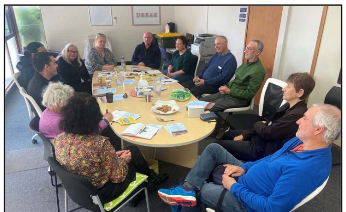
COMSUP Group meeting.

The CAB office opens Monday to Friday from 10am to 1pm and Saturdays from 10am to noon. Trained and qualified volunteers also include JPs each day.