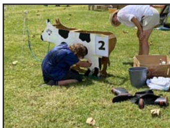
Milking a cow