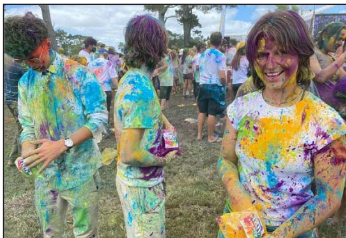
With my friends at the Holi Festival

Whilst still being in the spirit of celebration, the arrival of Helensville's A&P show is creeping around the corner. At Least while I write this. Almost running for 120 years, the A&P show has been the iconic event of Helensville. Acting as the centre of trade and display of arts, crafts and agricultural success. Ever since I was 5 I would always ask my parents the same question, "When is the A&P show?", due to the vibrance it generated and the sense of community it developed. I look forward to attending, with fingers crossed for a blessing of good weather. Without further ado, I want to thank the month of February for the warm memories it has so generously gifted me, and furnishing this year to a good start.