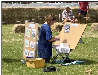
Sheep breeds & cuts of meat