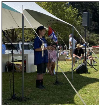
Giving a speech