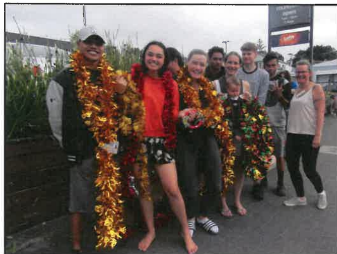
Te Whānau Tōhea was well represented.

Public response was very positive and there are high hopes that dressing our town for Christmas will become an annual event.