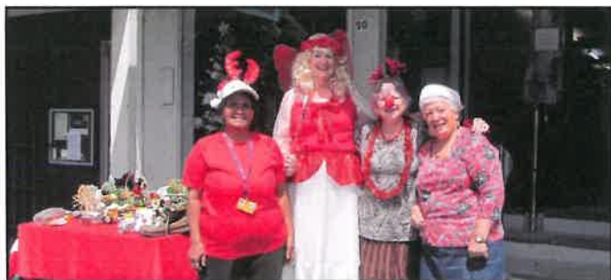
The community got into the spirit of the thing even if they weren't in the parade.