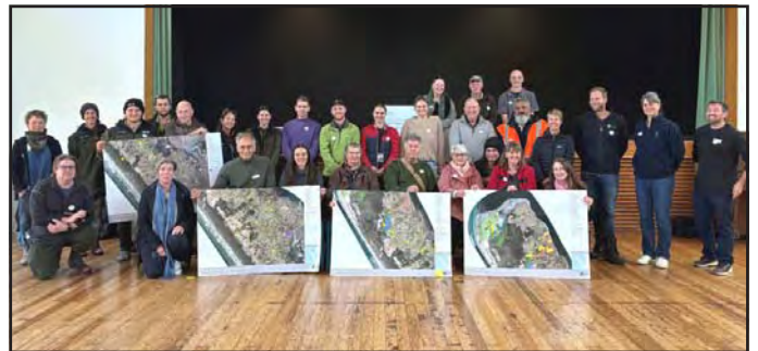
The forest bridge trust GAP Analysis.

The Forest Bridge Trust acknowledges the work undertaken by Nga Maunga Whakahii, South Kaipara Landcare, Auckland Council and Department of Conservation, whose funding is enabling this critical work on South Head to take flight.