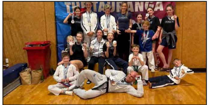
Superior Team Medal Haul at Tauranga Tournament

community plays a vital role in helping young athletes pursue national and international competition opportunities.