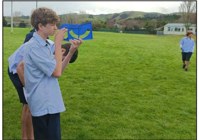
KC Trigonometry lesson - measuring the height of goal posts using a clinometer.