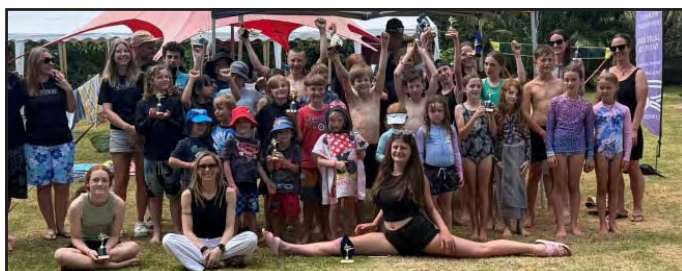
Superior Xmas Function at the Hot Pools

Unlike many mainstream sports, taekwondo receives limited funding, meaning athletes and their families often cover the costs of travel, accommodation, competition fees, and equipment themselves. To help make these opportunities possible, Superior Taekwondo students regularly participate in fundraising initiatives such as sausage sizzles and raffle sales. The support of the local