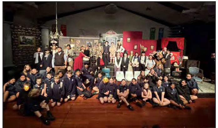
The cast of Kaipara College production of Baskerville with students from Parakai Primary School who attended a matinee performance.

Te WAKA o Kaipara: Navigate to Success Te WAKA o Kaipara: Eke panuku, eke Tangaroa